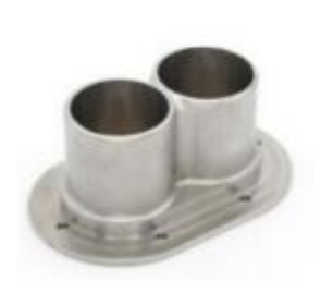
Carbon Steel Foundation Part