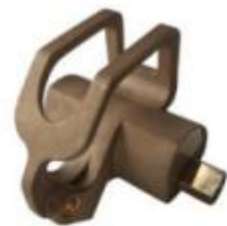
Brass Casting Parts