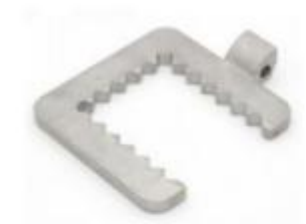
Mountaineering Equipment Accessories