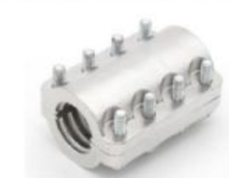
Building Equipment Fittings