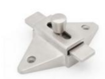
Steel Hinge Parts