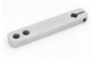
SS304 Casting With Machining