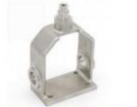
Agriculture Machinery Parts