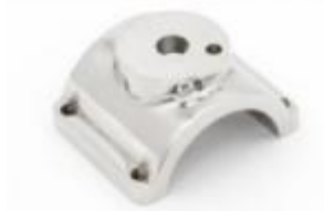
Mirror Polishing Part