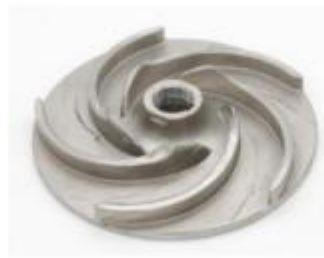
SS316 Impeller Parts